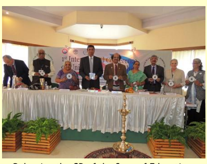
Releasing the CD of the Song of Education in Universal Human Values Prog.