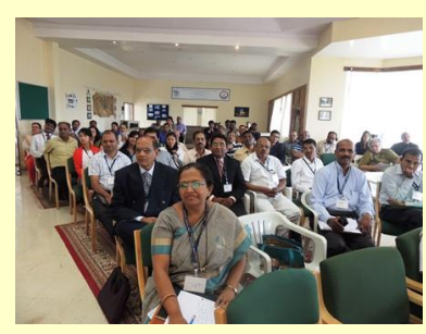
Some of the participants of the Conference