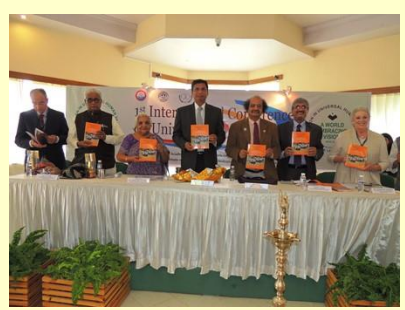
Releasing the book "Education in Action"