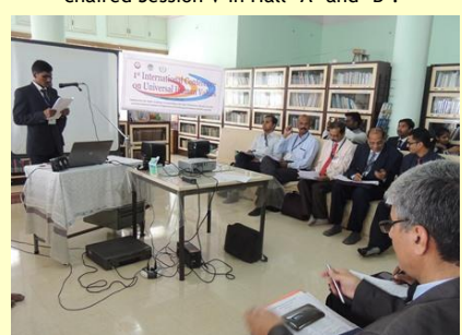
Students of Surabhi Computers, Wai, presenting their paper in Hall 'B'