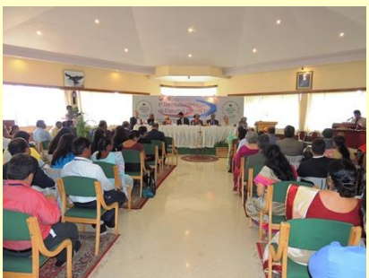
The Conference Hall "A"